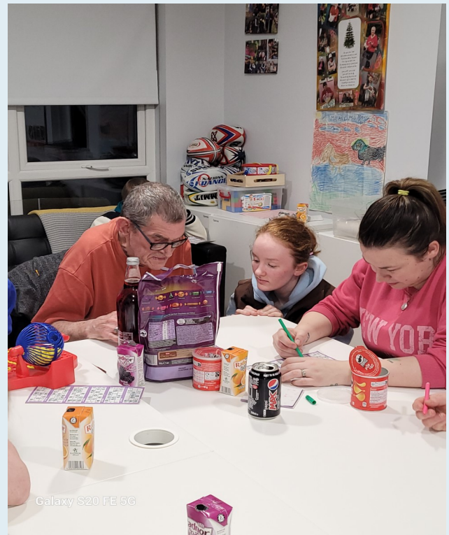
Galaxy S20 FE 5G