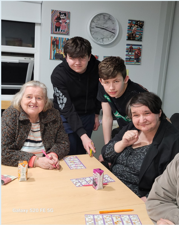
Galaxy S20 FE 5G