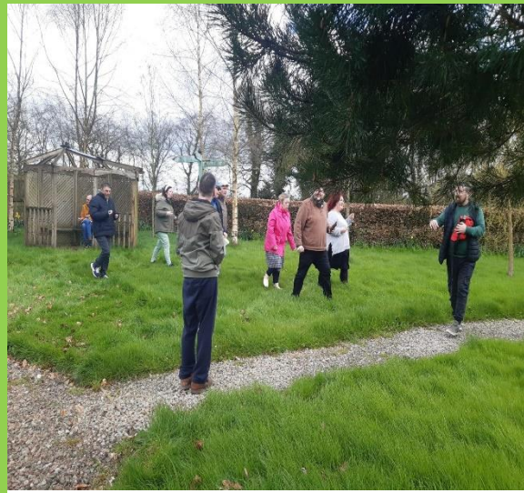
The Hunt is on!